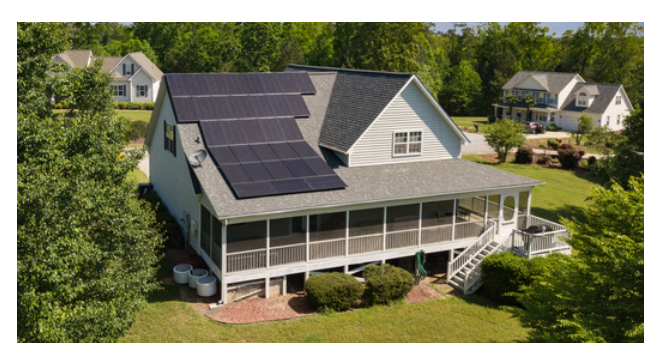
Solarize the Triangle Installation

The process identified infrastructure needed to shorten food supply chains, drive economic development, enhance resilient practices, foster equity, and increase rural-urban connectivity across 17 counties. This analysis is designed to inform food systems infrastructure policy decisions made by local government officials and will guide the three COGs as we embark on implementation.