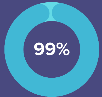
WAKE CO BROADBAND ACCESS