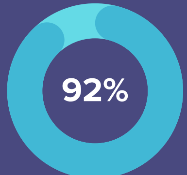
JOHNSTON CO BROADBAND ACCESS