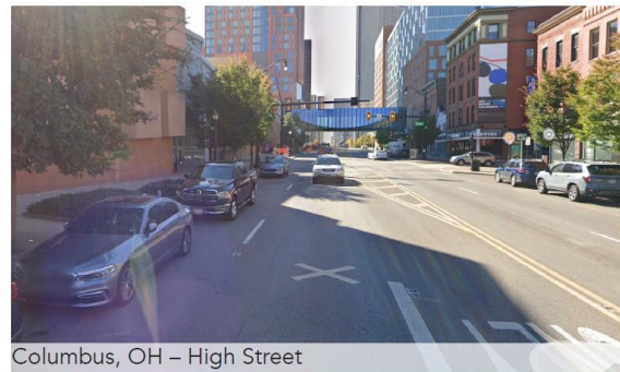
Columbus, OH – High Street