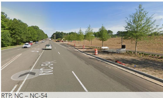
RTP, NC – NC-54