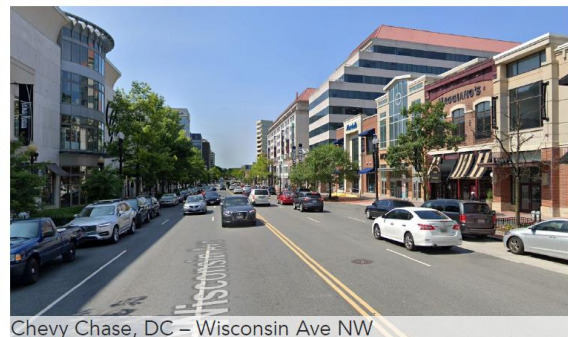
Chevy Chase, DC – Wisconsin Ave NW